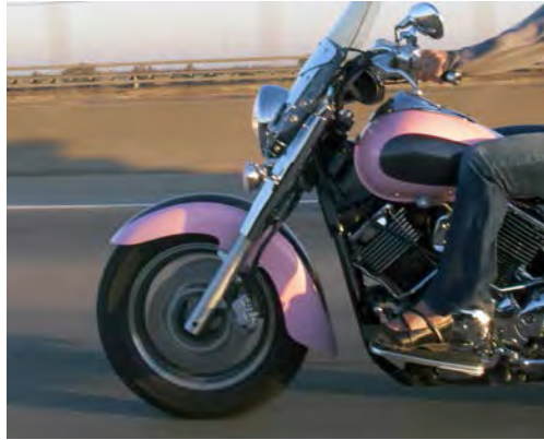
Figure 12.7 Although our society may have a stereotype that associates motorcycles with men, female bikers demonstrate that a woman's place extends far beyond the kitchen in the modern United States.

appropriate gender roles (Kane 1996). Children acquire these roles through socialization, a process in which people learn to behave in a particular way as dictated by societal values, beliefs, and attitudes. For example, society often views riding a motorcycle as a masculine activity and, therefore, considers it to be part of the male gender role. Attitudes such as this are typically based on stereotypes, oversimplified notions about members of a group. Gender stereotyping involves overgeneralizing about the attitudes, traits, or behavior patterns of women or men. For example, women may be thought of as too timid or weak to ride a motorcycle.