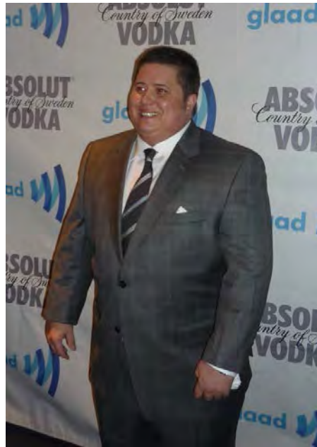
Figure 12.5 Chaz Bono is the transgender son of Cher and Sonny Bono. While he was born female, he considers himself male. Being transgender is not about clothing or hairstyles; it is about self-perception.