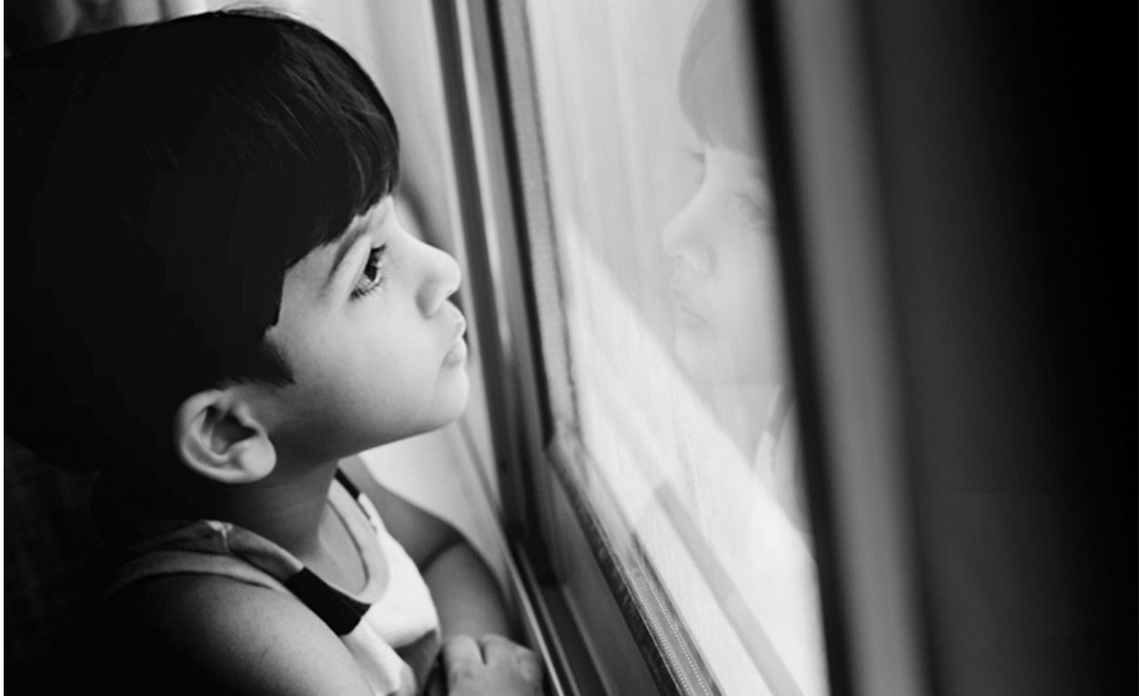
Figure 12.1 Some children may learn at an early age that their gender does not correspond with their sex.