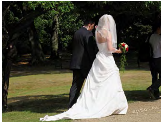
Figure 12.9 Sexual practices can differ greatly among groups. Recent trends include the finding that married couples have sex more frequently than do singles and that 27 percent of married couples in their 30s have sex at least twice a week (NSSHB 2010).