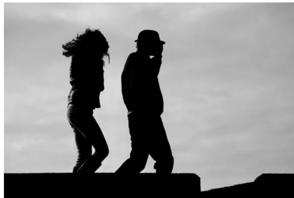
Figure 12.2 While the biological differences between males and females are fairly straightforward, the social and cultural aspects of being a man or woman can be complicated.

When filling out a document such as a job application or school registration form you are often asked to provide your name, address, phone number, birth date, and sex or gender. But have you ever been asked to provide your sex and your gender? Like most people, you may not have realized that sex and gender are not the same. However, sociologists and most other social scientists view them as conceptually distinct. Sex refers to physical or physiological differences between males and females, including both primary sex characteristics (the reproductive system) and secondary characteristics such as height and muscularity. Gender refers to behaviors, personal traits, and social positions that society attributes to being female or male.