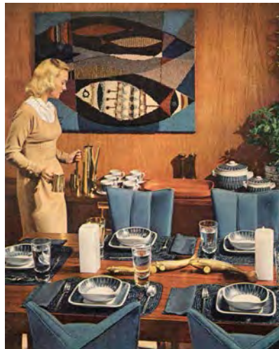
Figure 12.6 Traditional images of U.S. gender roles reinforce the idea that women should be subordinate to men.