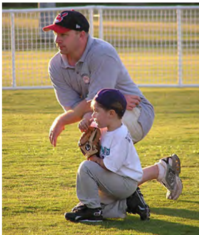
Figure 12.4 Fathers tend to be more involved when their sons engage in gender-appropriate activities such as sports.

One way children learn gender roles is through play. Parents typically supply boys with trucks, toy guns, and superhero paraphernalia, which are active toys that promote motor skills, aggression, and solitary play. Daughters are often given dolls and dress-up apparel that foster nurturing, social proximity, and role play. Studies have shown that children will most likely choose to play with “gender appropriate” toys (or same-gender toys) even when cross-gender toys are available because parents give children positive feedback (in the form of praise, involvement, and physical closeness) for gender normative behavior (Caldera, Huston, and O'Brien 1998).