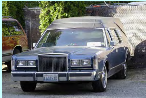
Figure 7.3 A hearse with the license plate "LASTRYD." How would you view the owner of this car?

Schoepflin theorized that, although viewed as outside conventional norms, driving a hearse is such a mild form of deviance that it actually becomes a mark of distinction. Conformists find the choice of vehicle intriguing or appealing, while nonconformists see a fellow oddball to whom they can relate. As one of Bill's friends remarked, "Every guy wants to own a unique car like this, and you can certainly pull it off." Such anecdotes remind us that although deviance is often viewed as a violation of norms, it's not always viewed in a negative light (Schoepflin 2011).