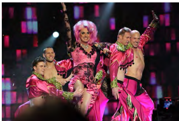
Figure 7.2 Much of the appeal of watching entertainers perform in drag comes from the humor inherent in seeing everyday norms violated.

What, exactly, is deviance? And what is the relationship between deviance and crime? According to sociologist William Graham Sumner, deviance is a violation of established contextual, cultural, or social norms, whether folkways, mores, or codified law (1906). It can be as minor as picking your nose in public or as major as committing murder. Although the word “deviance” has a negative connotation in everyday language, sociologists recognize that deviance is not necessarily bad (Schoepflin 2011). In fact, from a structural functionalist perspective, one of the positive contributions of deviance is that it fosters social change. For example, during the U.S. civil rights movement, Rosa Parks violated social norms when she refused to move to the “black section” of the bus, and the Little Rock Nine broke customs of segregation to attend an Arkansas public school.