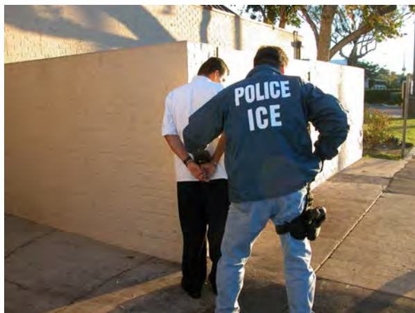
Figure 7.8 How is a crime different from other types of deviance?

Although deviance is a violation of social norms, it's not always punishable, and it's not necessarily bad. Crime , on the other hand, is a behavior that violates official law and is punishable through formal sanctions. Walking to class backward is a deviant behavior. Driving with a blood alcohol percentage over the state's limit is a crime. Like other forms of deviance, however, ambiguity exists concerning what constitutes a crime and whether all crimes are, in fact, “bad” and deserve punishment. For example, during the 1960s, civil rights activists often violated laws intentionally as part of their effort to bring about racial equality. In hindsight, we recognize that the laws that deemed many of their actions crimes—for instance, Rosa Parks taking a seat in the “whites only” section of the bus—were inconsistent with social equality.