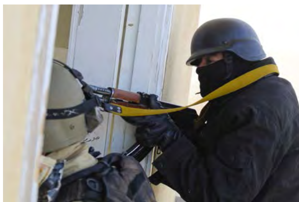
Figure 7.10 Here, Afghan National Police Crisis Response Unit members train in Surobi, Afghanistan.

State police have the authority to enforce statewide laws, including regulating traffic on highways. Local or county police, on the other hand, have a limited jurisdiction with authority only in the town or county in which they serve.