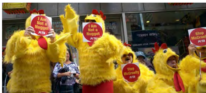
Figure 7.4 Functionalists believe that deviance plays an important role in society and can be used to challenge people’s views. Protesters, such as these PETA members, often use this method to draw attention to their cause.

Why does deviance occur? How does it affect a society? Since the early days of sociology, scholars have developed theories that attempt to explain what deviance and crime mean to society. These theories can be grouped according to the three major sociological paradigms: functionalism, symbolic interactionism, and conflict theory.