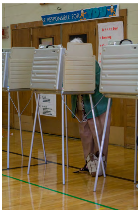
Figure 7.7 Should a former felony conviction permanently strip a U.S. citizen of the right to vote?

Opponents of felony disenfranchisement in the United States argue that voting is a basic human right and should be available to all citizens regardless of past deeds. Many point out that felony disenfranchisement has its roots in the 1800s, when it was used primarily to block black citizens from voting. Even nowadays, these laws disproportionately target poor minority members, denying them a chance to participate in a system that, as a social conflict theorist would point out, is already constructed to their disadvantage (Holding 2006). Those who cite labeling theory worry that denying deviants the right to vote will only further encourage deviant behavior. If ex-criminals are disenfranchised from voting, are they being disenfranchised from society?