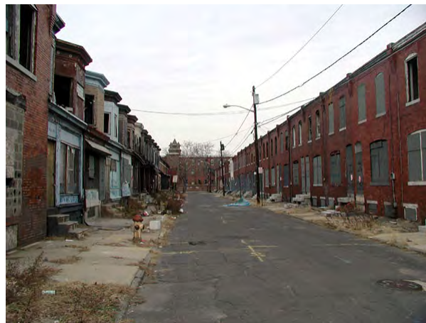
Figure 7.5 Proponents of social disorganization theory believe that individuals who grow up in impoverished areas are more likely to participate in deviant or criminal behaviors.

Developed by researchers at the University of Chicago in the 1920s and 1930s, social disorganization theory asserts that crime is most likely to occur in communities with weak social ties and the absence of social control. An individual who grows up in a poor neighborhood with high rates of drug use, violence, teenage delinquency, and deprived parenting is more likely to become a criminal than an individual from a wealthy neighborhood with a good school system and families who are involved positively in the community.