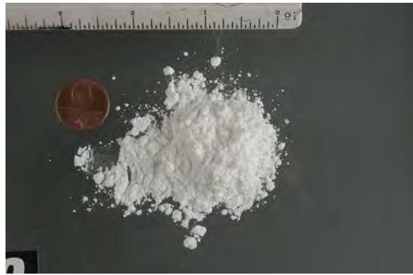
Figure 7.6 From 1986 until 2010, the punishment for possessing crack, a “poor person’s drug,” was 100 times stricter than the punishment for cocaine use, a drug favored by the wealthy.