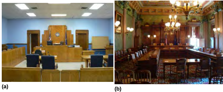
Figure 7.11 This county courthouse in Kansas (left) is a typical setting for a state trial court. Compare this to the courtroom of the Michigan Supreme Court (right).

Criminal cases are heard by trial courts with general jurisdictions. Usually, a judge and jury are both present. It is the jury's responsibility to determine guilt and the judge's responsibility to determine the penalty, though in some states the jury may also decide the penalty. Unless a defendant is found "not guilty," any member of the prosecution or defense (whichever is the losing side) can appeal the case to a higher court. In some states, the case then goes to a special appellate court; in others it goes to the highest state court, often known as the state supreme court.