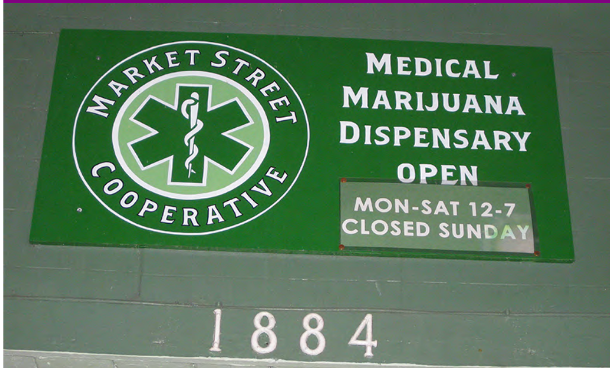
Figure 7.1 Washington is one of several states where marijuana use has been legalized, decriminalized, or approved for medical use.